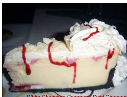
White Chocolate Raspberry Swirl Cheesecake.

The duck was perfectly cooked with the blackberry vinaigrette, giving tart complexities to the smooth heartiness of the breast.